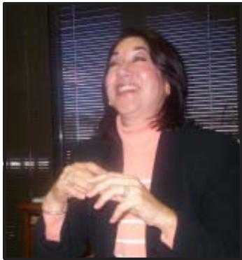
El colegio donde yo asiste fue "el colegio de la vida dura." (Risa) The college I went to was the "college of hard knocks."

Gonzalez: Si, Tenemos 6 oficinas, 4 en el Condado de Brazoria y 2 en Fort Bend .