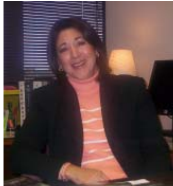
"Si no vas ir al colegio, entonces tienes que ponerte a trabajar."