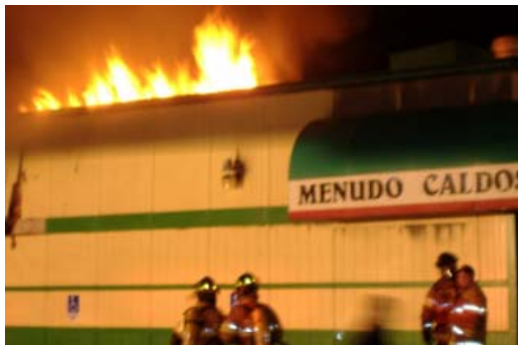
ARRIBA: Martes en la noche bomberos de Angleton y Lake Jackson respondieron a un incendio en el restaurante El Jimador . Llamas saltaron por el techo por casi una hora hasta que los bomberos llegaron a contralar la situacion.